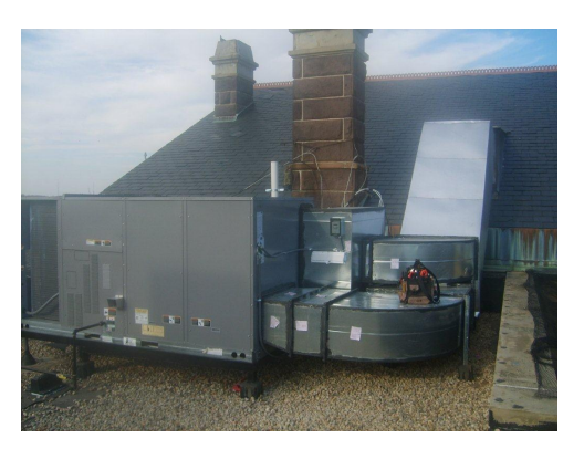
New Roof Top Unit